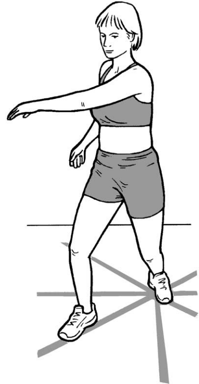
Fig. 3 Angle lunge with arm reach.

maintain balance and keep your lower back straight,