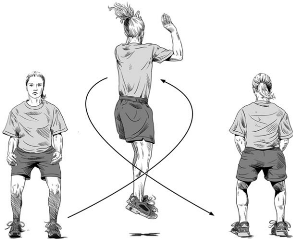
Fig. 3 180° squat.